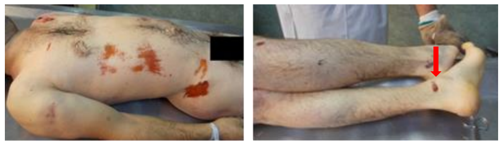
Fig. 4. Excoriated areas

9. inferiorly from the internal malleolus – solution of superficial continuity, well-delimited, with more or less of an oval shape, measuring 3/1 cm, with the long axis oriented obliquely, ascending from right to left (Fig. 5);