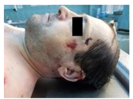
Fig. 3. Superficial wound

6. outer ear (auricle), median third of the helix – solution of superficial continuity, with bruised edges, covered discontinuously by reddish hematic crust, with a length of 4 cm;